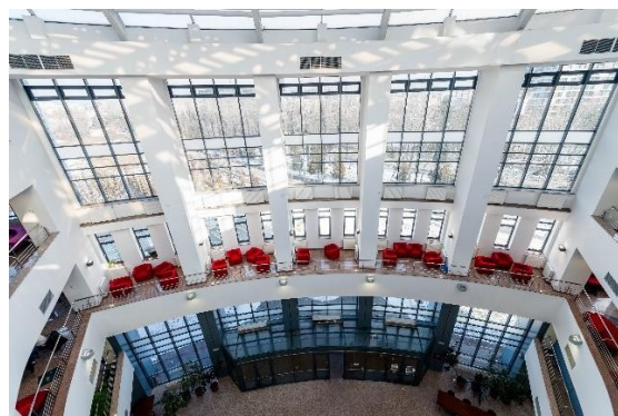
Figure 4. Central Library - Conference Room and halls