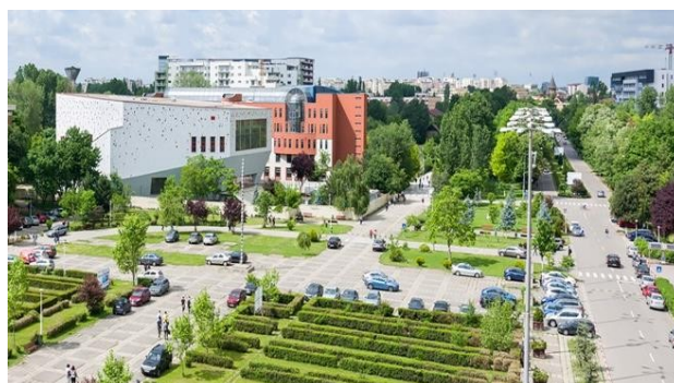
Figure 1. The Main Venue for the event

UPB research activities are among the top priorities of the university with two of the most important research hubs in the region – The occupy 50% of the entire surface Research Center for Advanced Materials, Products, and Processes - CAMPUS and the Research Center for Intelligent Products, Processes and Services - PRECIS. These buildings offer state-of-the-art facilities, and