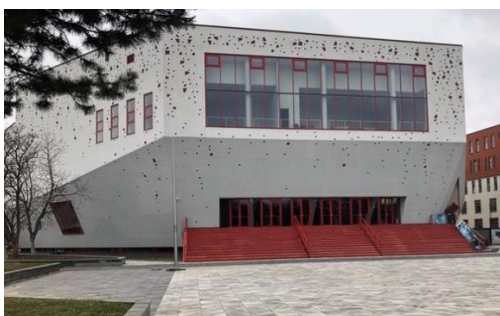
Aula Conference Center

The registration desk for participants is located at the entrance area of the Aula Conference Center. Volunteer students will guide the participants within the Campus, as well as in the two buildings.