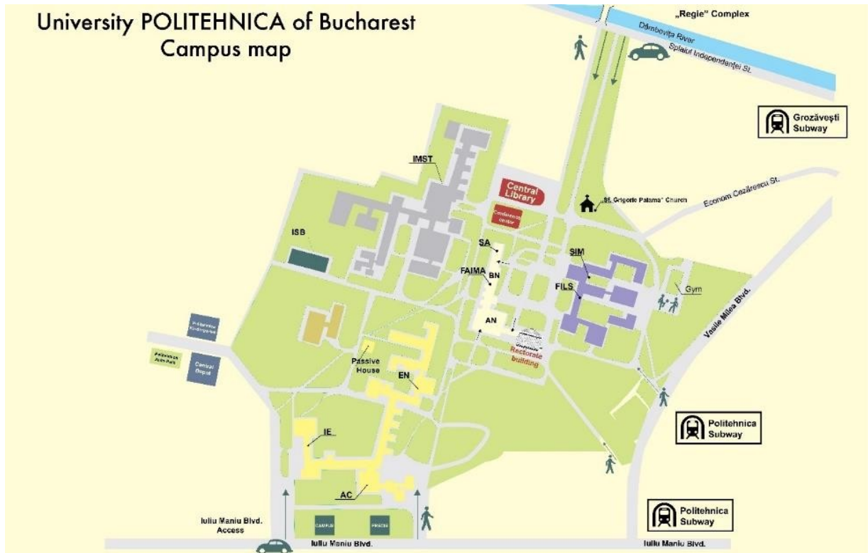
Figure 2. UPB Campus Map